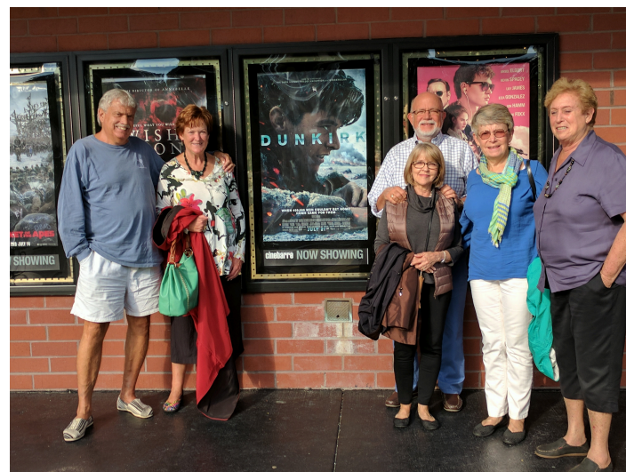
"Dunkirk" Movie Outing

The fun continues, along with I'On At Home's educational sessions (which, by the way, can be fun too)! Many of you enjoyed The Blue's Cruise and Collector's Corner. We also went to the movies, had an excellent workshop on using email and a fun Monday Matinee.