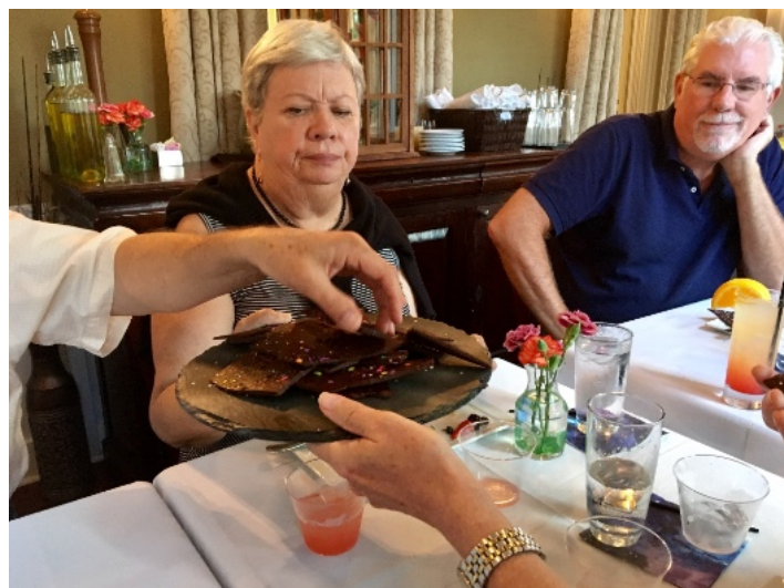
Fratellos Eclipse Drink Selection