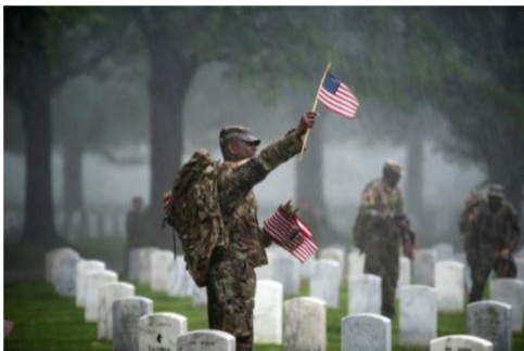
Soldiers from the 3d U.S. Infantry Regiment (The Old Guard) place flags in Arlington National Cemetery

It's unclear exactly where the holiday originated and Charleston is among the towns that claim to be the birthplace of Memorial Day. During the Civil War 257 Union soldiers died in prison here and were buried in unmarked graves. Charleston's black residents organized a May Day ceremony in which they landscaped a burial ground to properly honor the soldiers.